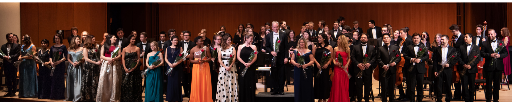
Gala Jeunes Ambassadeurs Lyriques, Montréal, 2018

Opera America – Opera.ca – Conseil Québécois de la musique - Montréal Culture